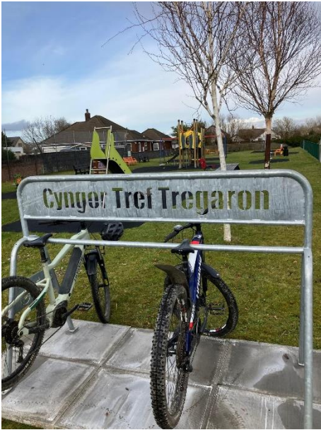
Raciau beiciau / Bike Racks