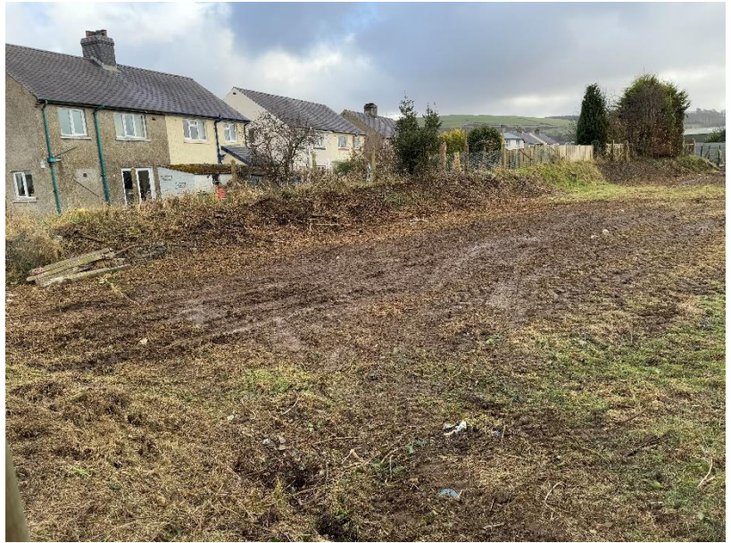
Gardd Gymunedol / Community Garden