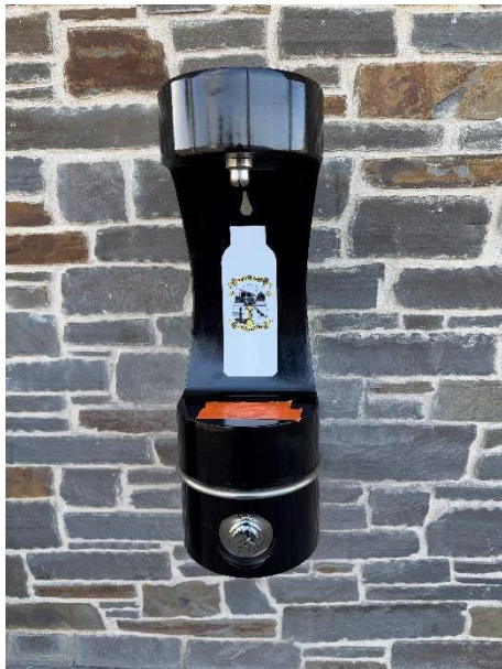
Ffynnon ddŵr / Water fountain