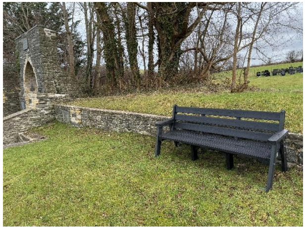
Adfer Capel Wesley a mainc newydd / Restoration of Wesley Chapel & new bench