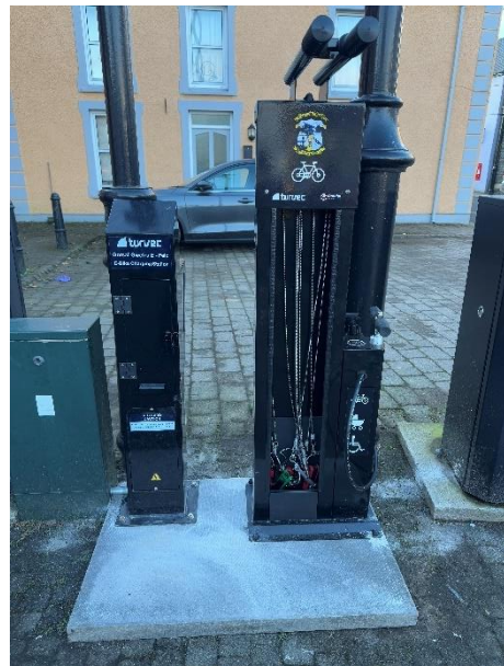
Stodin cynnal a chadw beiciau a gwefrydd e-feic Bike maintenance stand and e-bike charger