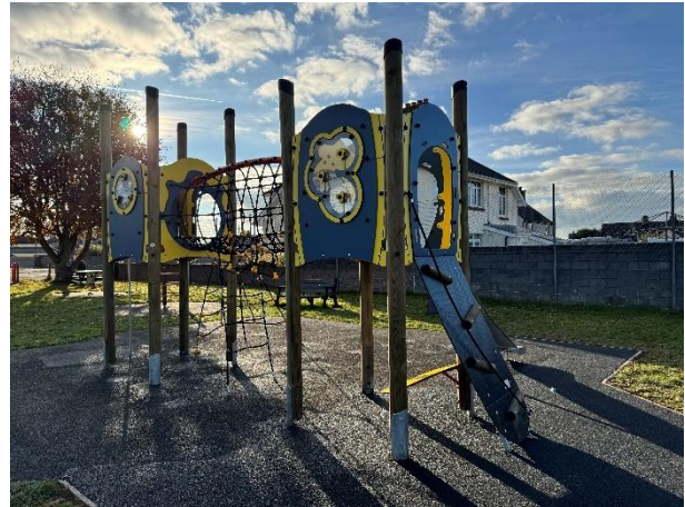
Offer newydd yn y Parc / New equipment at the Park